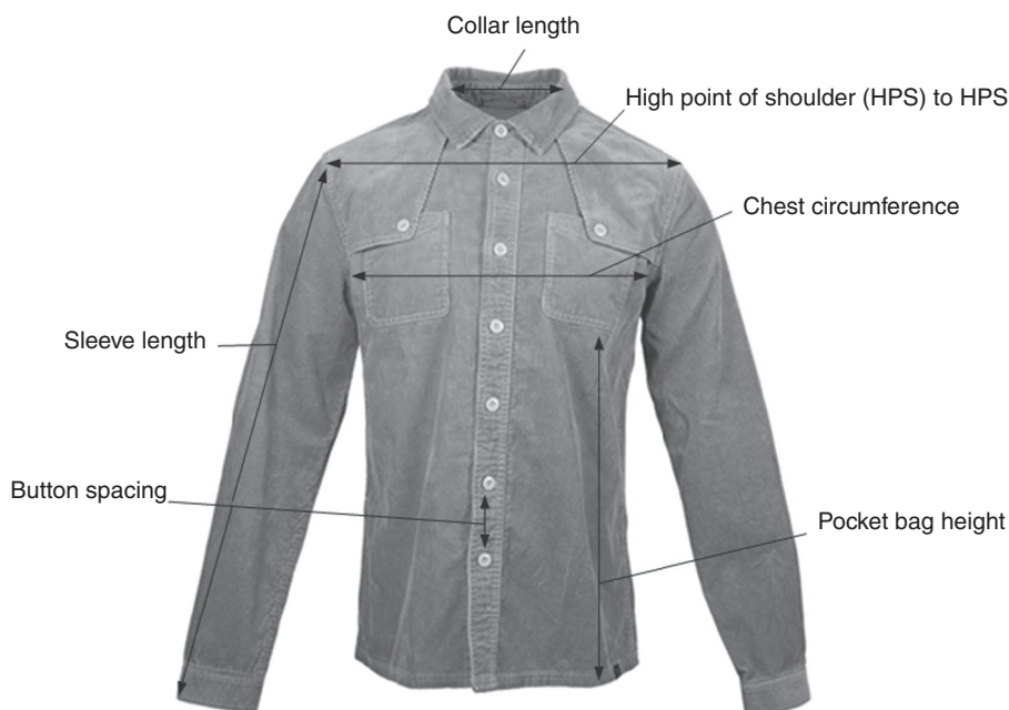
Figure 2. Product feature parameters identified for the FARM