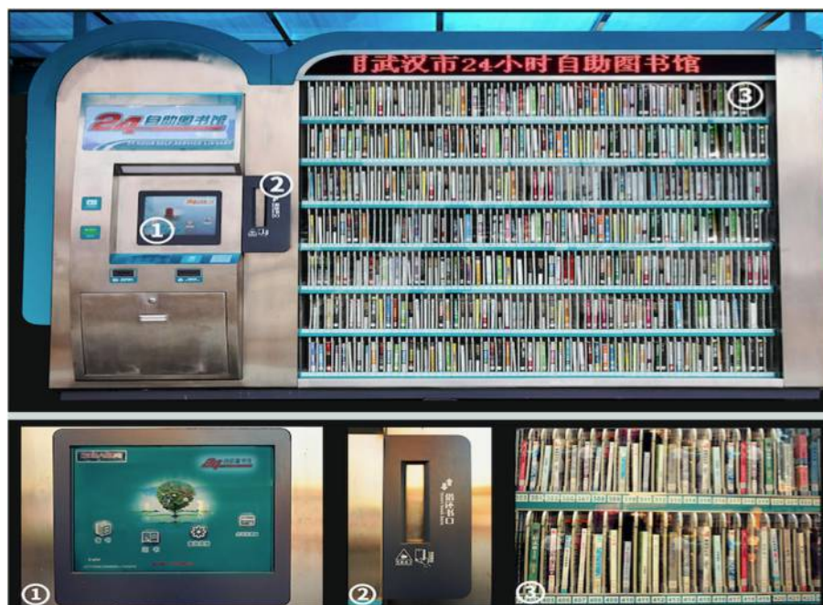
Figure 1. A Photo of Wuhan Street SSL

A deposit of CNY 100 (approximately USD 15) is required for new user registration in order to ensure that books will be returned on time, undamaged. If a book is not returned on time, a CNY 0.5 fine will be charged from the deposit for each day overdue. Moreover, if a book is lost or damaged, the patron will be asked to pay for it, usually