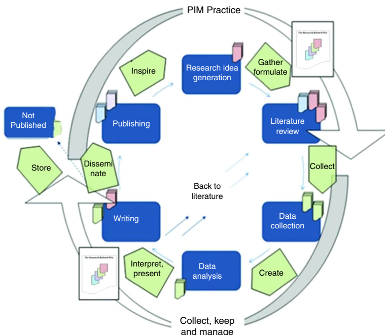
Figure 1. The creation of the research-related personal information collection