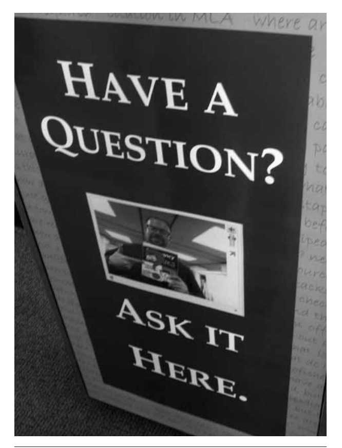
Figure 22 Kiosk redesign.

The Alden Library Reference Department recently added an innovative new component to its virtual reference services-video chat. This pilot program uses rapidly improving internet video communication technology to provide a face-to-face virtual connection with users both inside and outside of the Libraries. While undeniably effective, other types of virtual reference service types such as IM and email reference can create something of a digital divide between librarians and users. Few other libraries have experimented with video call technology in this way, and our pilot seeks to test whether video services can provide an additional and more personal means of virtual research help to our patrons...The project will continue with a new kiosk on the 4th floor opposite the main entrance doors, which will hopefully attract increased traffic and give the service a more public face. We will also allow users to call in from outside