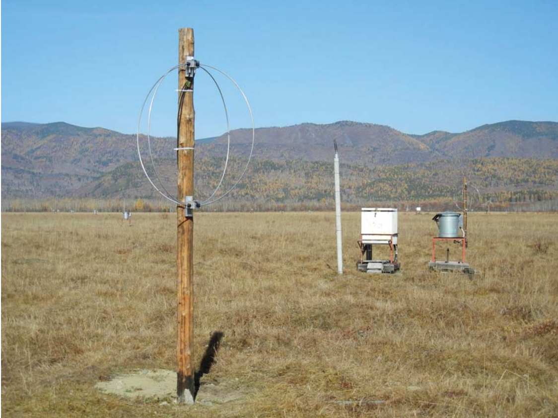
FIGURE 2. Tunka-Rex antenna (SALLA). It is connect to the cluster DAQ (white box) which is close to the one PMT detector.

strated an X_{\max} precision competitive to air-Cherenkov and air-fluorescence measurements. However, the main reason for the bad X_{\max} resolution of LOPES seems to be the high ambient noise level there. In rural areas, the ambient noise level usually is much lower [25], and at least for the rate of background pulses, this is already confirmed by first measurements at Tunka. Thus, for Tunka-Rex we expect a better X_{\max} precision, which we will check by a cross-calibration with the radio and air-Cherenkov hybrid events.