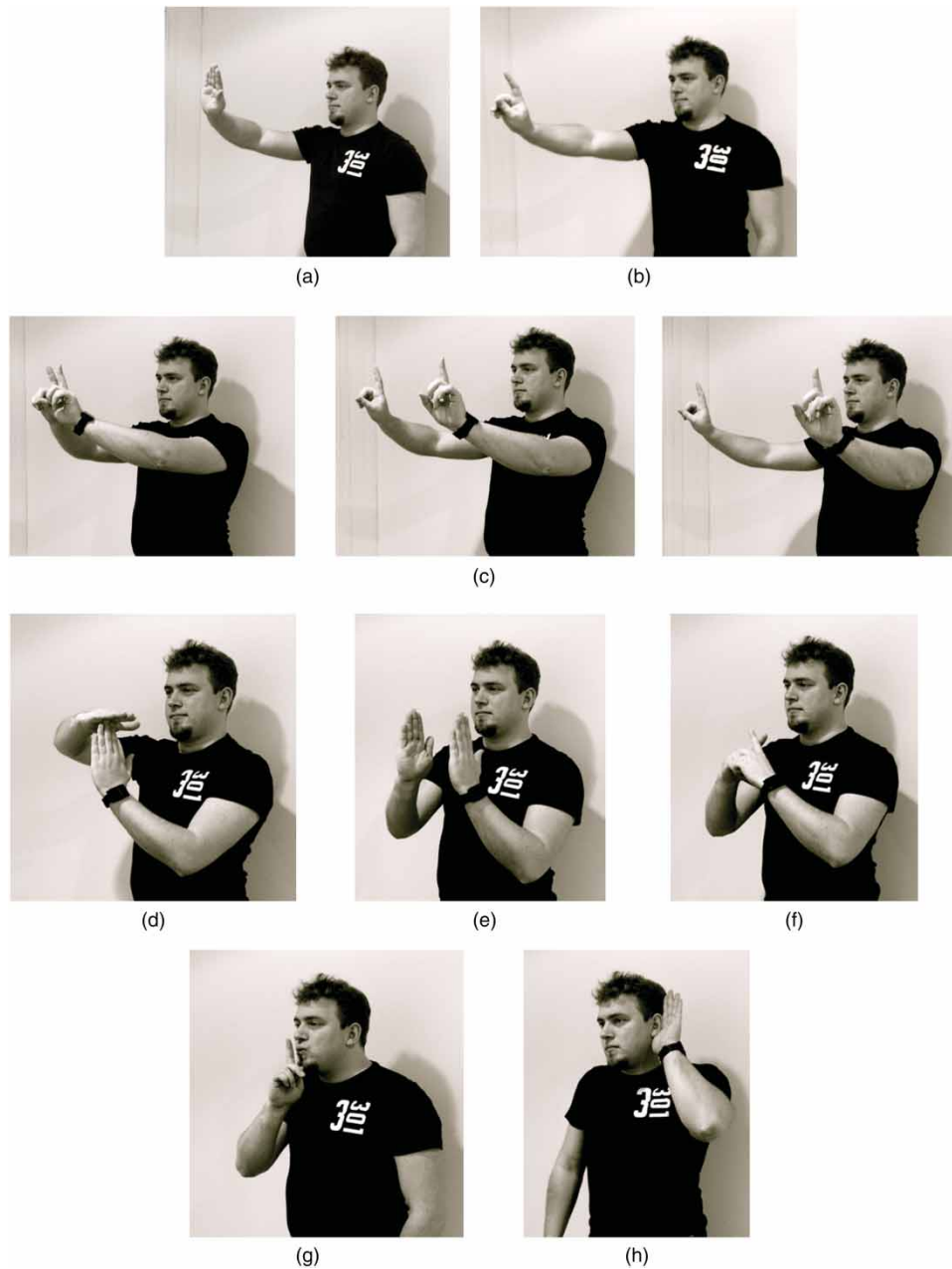
Figure 1. The different hand gestures for the gestures interaction: (a) swipe, (b) pointing and dragging, (c) zooming in, (d) the Tee gesture, (e) the pause gesture, (f) mute/activate audio, (g) lower volume and (h) increase volume.

(a gesture easy to recognise by the system as it is used often) was proposed to take control of the system.