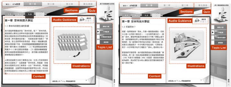
Figure 3. User interface design