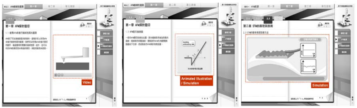
Figure 4. Media design (video, animation, interactive media)