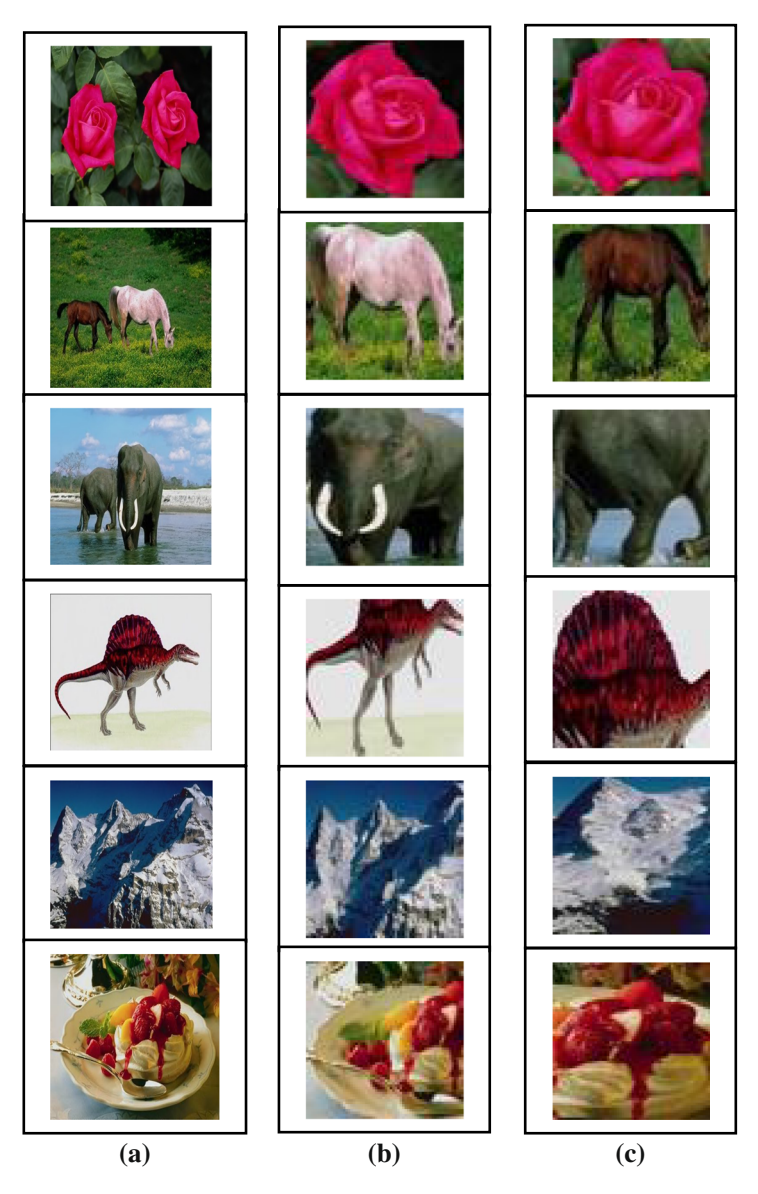
Figure 2. Significant regions: (a) the input image, (b) the primary significant region, (c) the secondary significant region.

manually categorized into 9 semantic categories namely Sky, Water, Tree and Grass, Falls and River, Flower, Earth and Rock and Mountain, Ice and Snow and Mountain, Sunset and Night. We calculated and plotted the interpolated precision-recall curve in figure 1d. The Area Under Curve (AUC) for the proposed method is 0.79 and for SIRRS is 0.77. The average precision of the proposed method (81%) is higher than that of the SIRRS (69%). In other words the proposed method is more accurate than SIRRS. The SIRRS method has employed off-line learning to segment an image. Without having the expensive learning procedure, our proposed method produces higher retrieval precision than SIRRS.