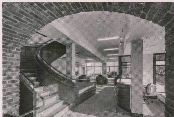
Caring Health Center - Springfield

DIETZ & COMPANY ARCHITECTS DESIGN THAT LOOKS GOOD, DOES GOOD