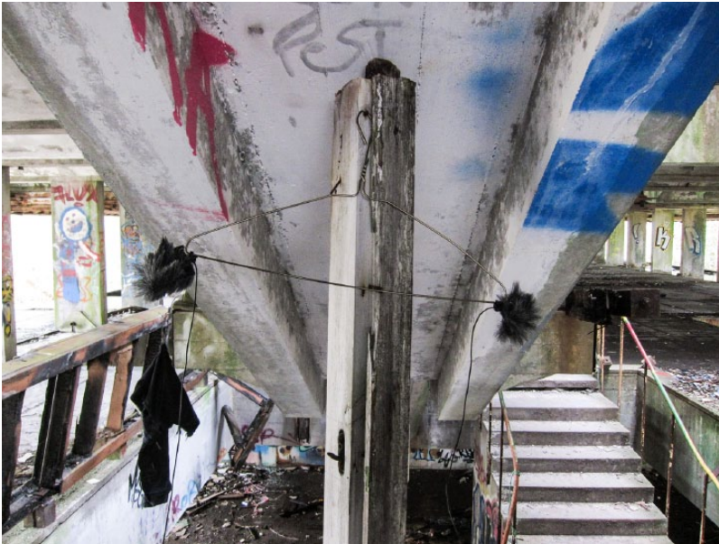
Figure 3. A spaced pair of miniature DPA 4060 omnidirectional microphones mounted on a wire coathanger and used to record an impulse response from the chapel area. The furry covers are Rycote wind jammers, used to prevent wind noise.

processed using Fourier Transform functions to make it sound more or less as though it had been made in the space where the impulse response was recorded.