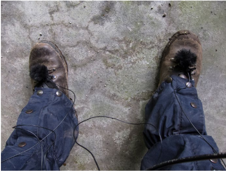
Figure 5. DPA 4060 microphones attached to walking boots to record footsteps and textures underfoot.

unseen sources seeping in – distant shouts, echoing noises emanating from the seminary, a persistent low frequency drone whose source is obscure.