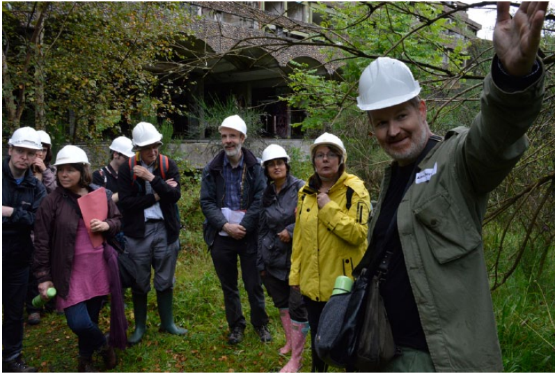
Figure 2. Participants in an Invisible College activity day.

listeners about Kilmahew, ‘putting geographical information out into the field, to be understood in the context of a location’. 19 It was also designed to be participatory, involving members of the local community in making recordings, identifying sounds to record and offering their stories and memories for recording. We anticipated that local residents would be the primary audience for the work due to their proximity to the site.