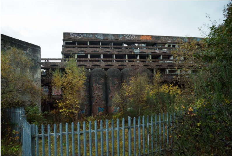
Figure 1. The ruins of St Peter's College, near Cardross.

contested place, it is often referred to as Scotland's finest modernist building, but many local residents consider it an eyesore that should have been demolished years ago.