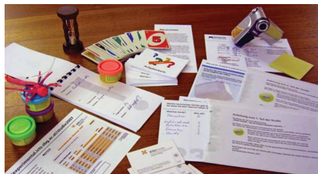
Figure 1. Example of playful probing material distributed to the households.

The interviewer visited the households in both countries at the beginning of the study and provided a questionnaire to focus on devices and equipment that were currently installed in the household and the playful probe package (see Figure 1 as an example) including creativity probing cards, modelling clay, pens and post-it notes. The French households received a specially designed game called ‘1000 miles’ that focused on the central research questions on interaction techniques, applications and overall awareness building, while the game in Austria was a variation of a game called Personality – asking the participants to construct a TV product that best fits their needs (including questions related to the control of this TV product). The modelling clay was added to the probe package to encourage the participants to build some designs of simplified versions of the controls they would want to have.