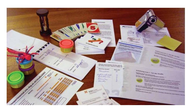
Figure 1. Example of playful probing material distributed to the households.

The interviewer visited the households in both countries at the beginning of the study and provided a questionnaire to focus on devices and equipment that were currently installed in the household and the playful probe package (see Figure 1 as an example) including creativity probing cards, modelling clay, pens and post-it notes. The French households received a specially designed game called '1000 miles' that focused on the central research questions on interaction techniques, applications and overall awareness building, while the game in Austria was a variation of a game called Personality – asking the participants to construct a TV product that best fits their needs (including questions related to the control of this TV product). The modelling clay was added to the probe package to encourage the participants to build some designs of simplified versions of the controls they would want to have.