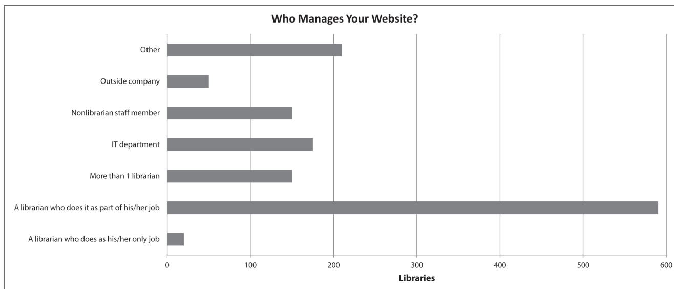
Figure 3. Academic and Public Library Website Management