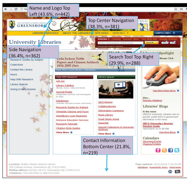
Figure 2. Location of Main homepage Elements

For academic library websites specifically, user access to course reserves was prevalent (92.9 percent), and 84.3 percent of both public and academic library websites offered patrons information about interlibrary loans (ILL). Public library websites consistently provided information about services for children and teenagers (84.2 percent survey, 91.1 percent evaluation) and information about branch libraries (80.4 percent) as well.