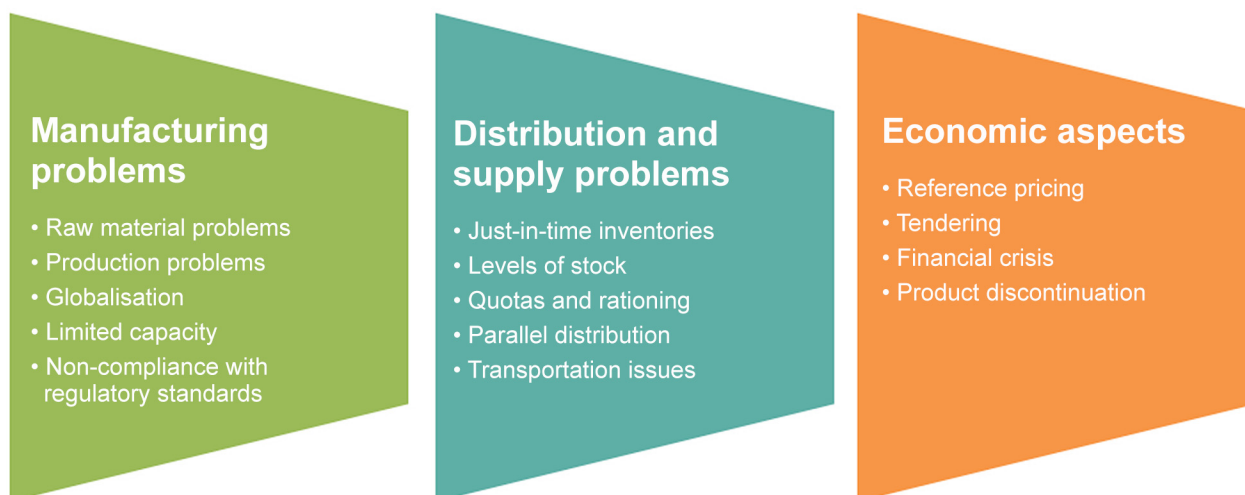
Fig 1. Categories and sub-categories of the reported determinants of drug shortages.

Manufacturing problems. “There has always been a potential for manufacturing problems”, said one industry representative. “We have the same quality defects as before. They do happen and we just have to get them fixed; sometimes this may lead to the closure of a factory”, explained another one. Reflecting on the typology of reasons for drug shortages, as well as utilizing their own professional experiences, the industry representatives claimed that drug shortages being the result of manufacturing problems could be linked to underlying problems with the raw materials or APIs, inadequately sized production facilities, global sourcing, production or quality issues, manufacturing capacity issues, or non-compliance with applicable regulatory