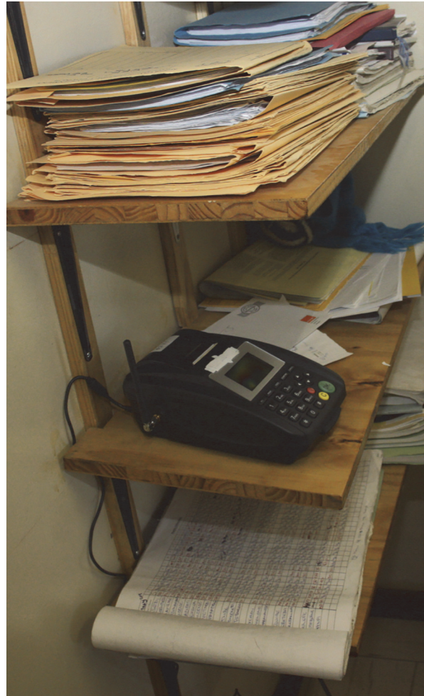
Fig 3. Mobile SMS printer in use. Printer is installed in an exam room of a study antenatal clinic.