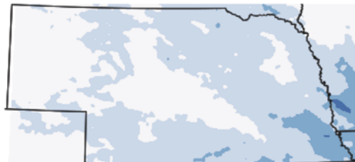
Image (png) returned by the above request with JSON object specifying colors (cmap), range of data values, contour levels and image size. Each of these parameters can be set in the parameters object

{ "cmap": [ "#f7fbff", "#c6dbef", "#6baed6", "#2171b5", "#08306b" ], "range": [ 0.004448307678103447, 0.3454032242298126 ], "levels": [ 0.10000000149011612, 0.20000000298023224, 0.30000001192092896, 0.4000000059604645 ], "size": [ 350, 161 ] }