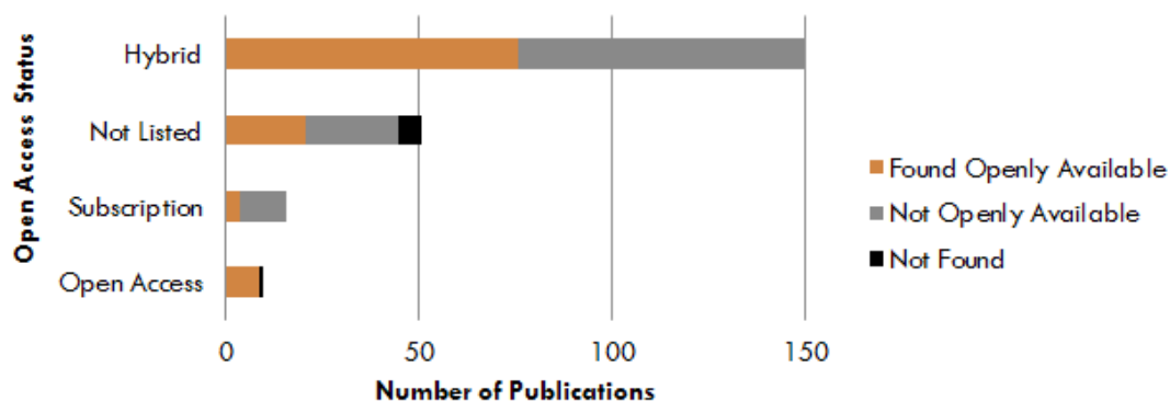
Figure 2. Availability and Open Access Status. Full-text for half of the set of CNS-funded papers has been found openly available across all access categories.