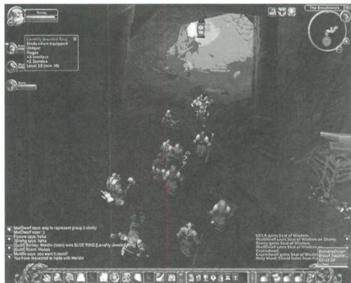
Figure 3 World of Warcraft , the most popular MMORPG in North America.

This chapter presented the evolution of social virtual worlds as seen in key historical developments, beginning in 1979 with the development of text-based multiuser games known as MUDs. Ten years later, TinyMUDs and MOOs were played over TelNet with a low number of synchronous users who emphasized social interactions and creation over combat and adventure quests.